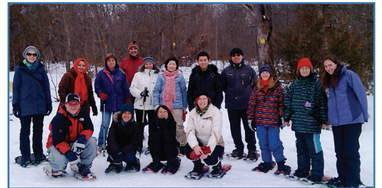
Cross-country skiing and snowshoeing at Camp Kawartha