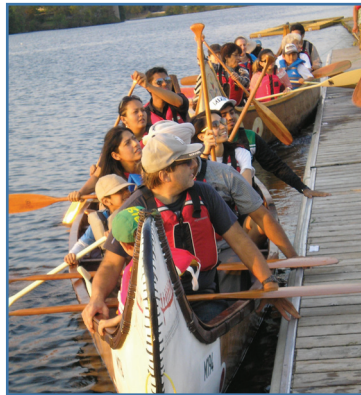
Picnic & Paddle on the Otonabee River