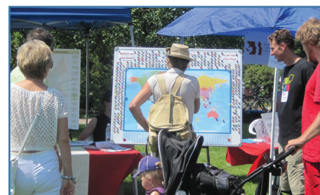
"Where are you from?" interactive map at the PPCII booth on Multicultural Canada Day