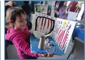
Outer Space at the Art Gallery of Peterborough