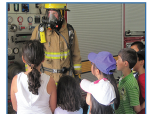
Visit to the Fire Hall