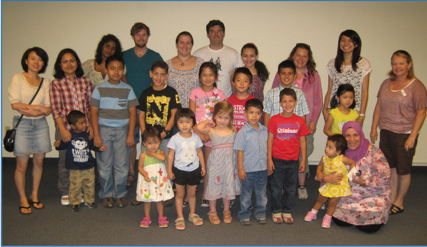
End of Summer Party at the Peterborough Public Library