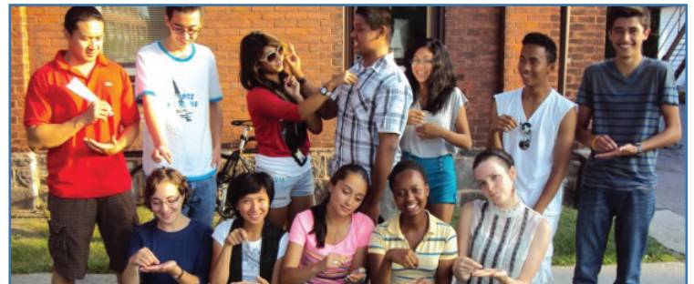
Summer "Make It Write" Group

Thank You for the Support from our Partners which include Peterborough Public Library, Friends of the Library, Peterborough Family Resource Centre, Peterborough County-City Health Unit, City of Peterborough Emergency Task Force, Art Gallery of Peterborough, COIN, YMCA, KPRDSB, PVNCCDSB and Kinark