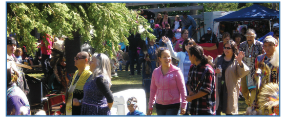
Curve Lake Powwow