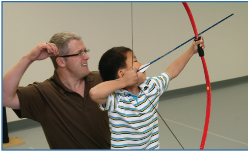
Archery & Fishing at OFAH