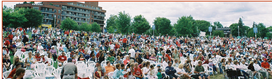
The crowd at Multicultural Canada Day, 2007.