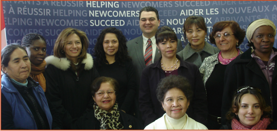
Dean del Mastro, MP, with NCC clients during the CIC funding announcement.