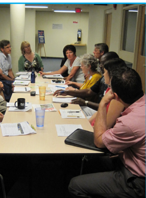
II Sector Working Group