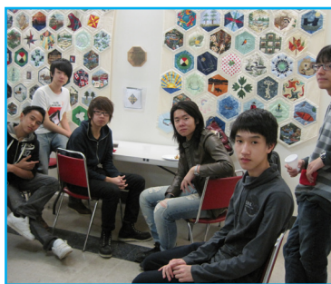
Student volunteers from PCVS