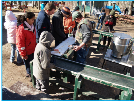
Tasting fresh maple syrup at Sugar Bush Sandy Flat