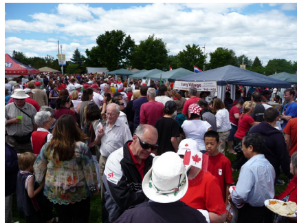
The demand for a taste of the 2010 international food tents was unprecedented!

The Multicultural Canada Day celebration was well covered by local media. The diversity of the stage performances and the delicious international cuisine seem to draw bigger crowds each year. We thank our media partners for recognizing the important role immigration has and will continue to play in Canada's history. Other headlines NCC made include: