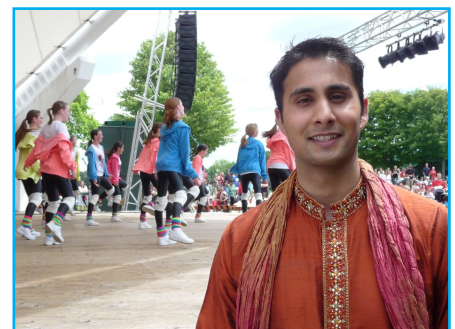
Back stage at Del Crary Park on Canada Day