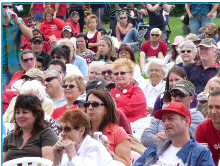
A sample of the several thousand who took in the multicultural performances at Del Cray Park