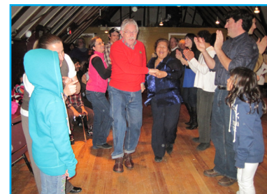
NCC volunteers work hard- and Square Dance even harder! This photo was taken at the December Volunteer Appreciation Dinner.