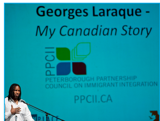
Georges Laraque at Showplace Peterborough

The PPCII Integration Strategy was facilitated by Jeanmarie Herlihy.