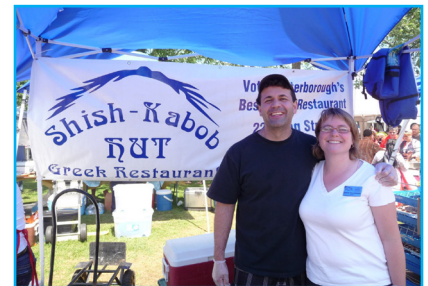
Shish Kabob Hut's food tent on Canada Day