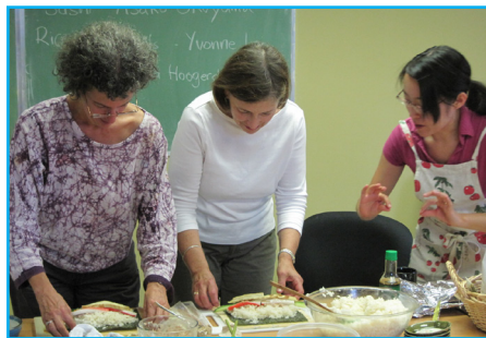
NCC clients shared their talent at “Wrap It Up!”