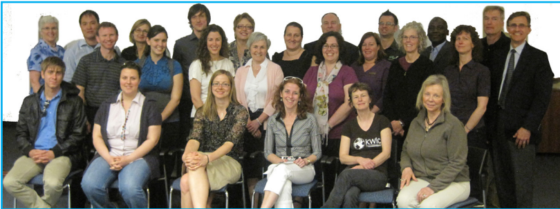
PPCII members at the Spring 2011 Meeting