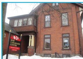
205 Sherbrooke Street