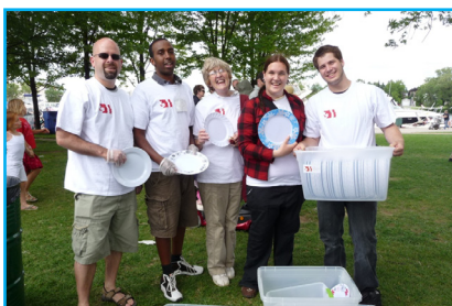
Dozens of volunteers distributed and washed thousands of reusable dishes for Multicultural Canada Day's 'greening' initiative