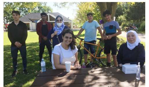
NCC's Newcomer Youth Group receives added support to help them learn online and gain employment

We're so grateful to the RBC Foundation for their support and making newcomer youth a priority at a time when they need it most.