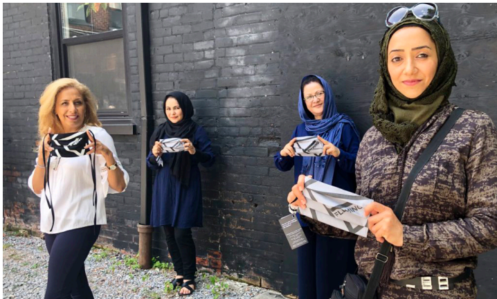
The Newcomer Sewing Crew have been creating masks for the general public, and most recently, Fleming College.