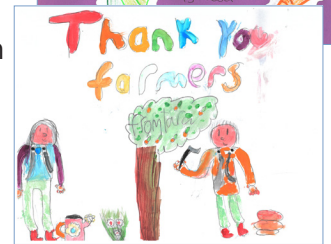
Welcoming messages were delivered to migrant farm workers letting them know how much they are appreciated