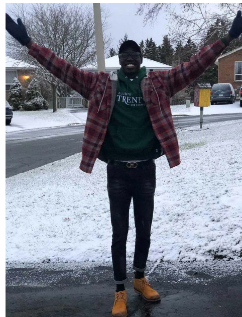
My first winter experience in Canada, 2021.

I hope to leave a footprint as I serve newcomers who share the same experiences as I. We are in this together!