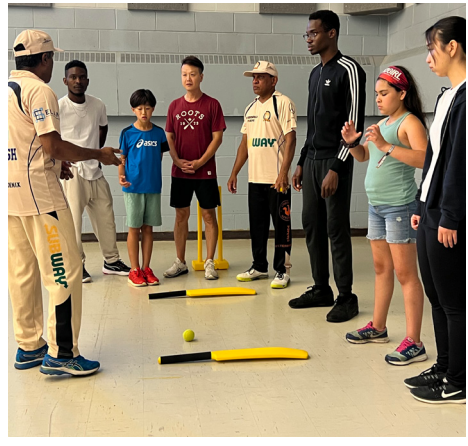
People of all ages were excited to learn how to play the traditional game of Cricket!