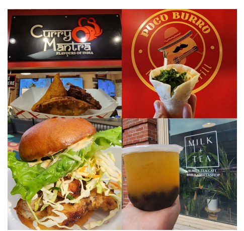
On the Multicultural Food Crawl Food Sampling Day, community members had a chance to eat their way around the world in downtown Peterborough.

Throughout the week, we were inspired by the enthusiasm of all who participated. Newcomers were proud to share their culture and were met with open hearts and minds! These experiences left deep impressions on our journey towards being a welcoming community for all.