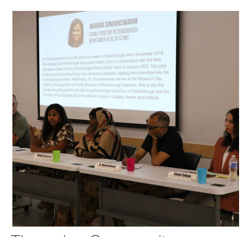
Through a Community Conversation on World Refugee Day, we raised awareness of the resettlement journey for refugees and discussed how people could help.