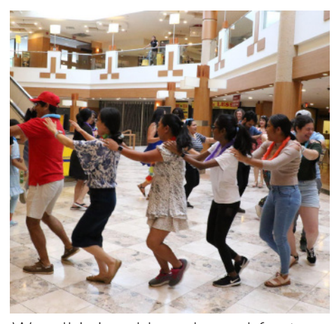
We all joined hands and feet to explore new movements through Zumba, Salsa, and K-pop Dance.