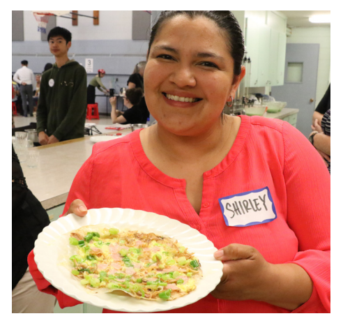
We learned more about Vietnamese culture through quizzes and games. Everyone was excited to learn new recipes!